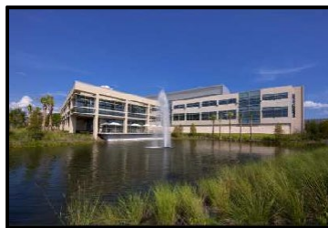
UCF Lake Nona Cancer Center, Health Sciences Campus