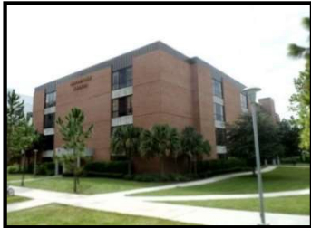
Biomedical Sciences Building, Main Campus

Faculty and staff in the School are located in five areas: The Biomedical Science and Health & Public Affairs II Building on Main Campus, the Biomedical Research Annex in Research Park, the Burnett Biomedical Sciences facility, adjacent to the College of Medicine, and the Lake Nona Cancer Center at the Lake Nona Medical City Campus.