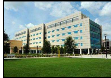
Burnett Biomedical Sciences Building, Health Sciences Campus