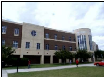
Health & Public Affairs II Building, Main Campus