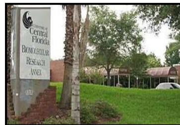
Biomedical Research Annex, Research Park