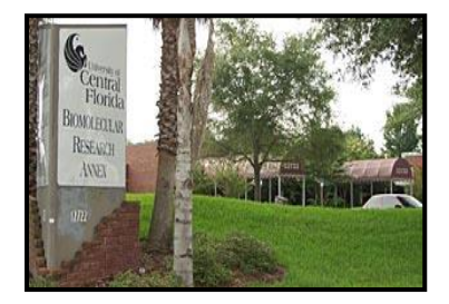
Biomedical Research Annex, Research Park